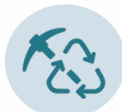
Artisanal mining (circular economy)