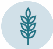
Agriculture, food, and agro-processing

Each step includes actionable practices tailored for enterprises and investors. Successful IMM requires alignment between strategy and implementation across all parties. The IMM journey is cyclical—continuously improving through active management and feedback loops, resulting in stronger systems and measurable SDG impact.