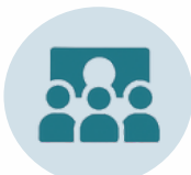
Microfinance Institutions (MFIs)