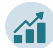
Impact funds (VC & PE)