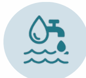
Water, sanitation (WASH), infrastructure, and transport