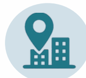
Special Economic Zones