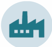
Manufacturing (textiles, leather, wood)